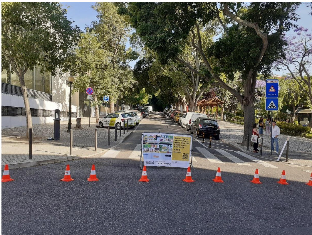
Figure 4 Traffic restriction implemented, in EB Santo Amaro, 4th of June 2024

On the 4th of June, celebrating Children's Day and Bicycle Day, a pop-up test was implemented in EB Santo Amaro (Alcantara Parish), with great acceptance from all the stakeholders involved.