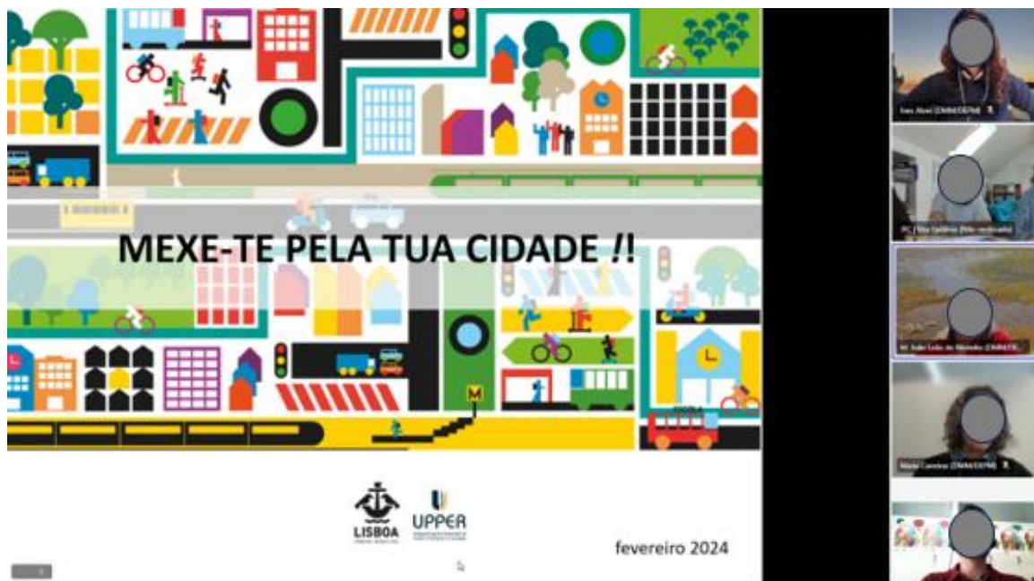
Figure 1 Teams meeting with one of the Parishes

Bi-lateral meetings (February 2024) with 4 Parishes were conducted to introduce this UPPER measure, branded through the Mexe-te pela Tua Cidade municipal program. This programme promotes safety and active modes in school surroundings with the closure of several streets to cars users (non-residents) during morning school entrance schedule, once a week, throughout an entire school year.