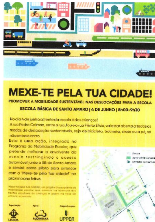
Figure 5 Event Flyer, in EB Santo Amaro, 4th of June 2024

During summer 2024, CML is conducting meetings with the stakeholders in order to prepare all the work necessary to implement (human resources, promotion materials, equipment necessary) in the beginning of the next school year.